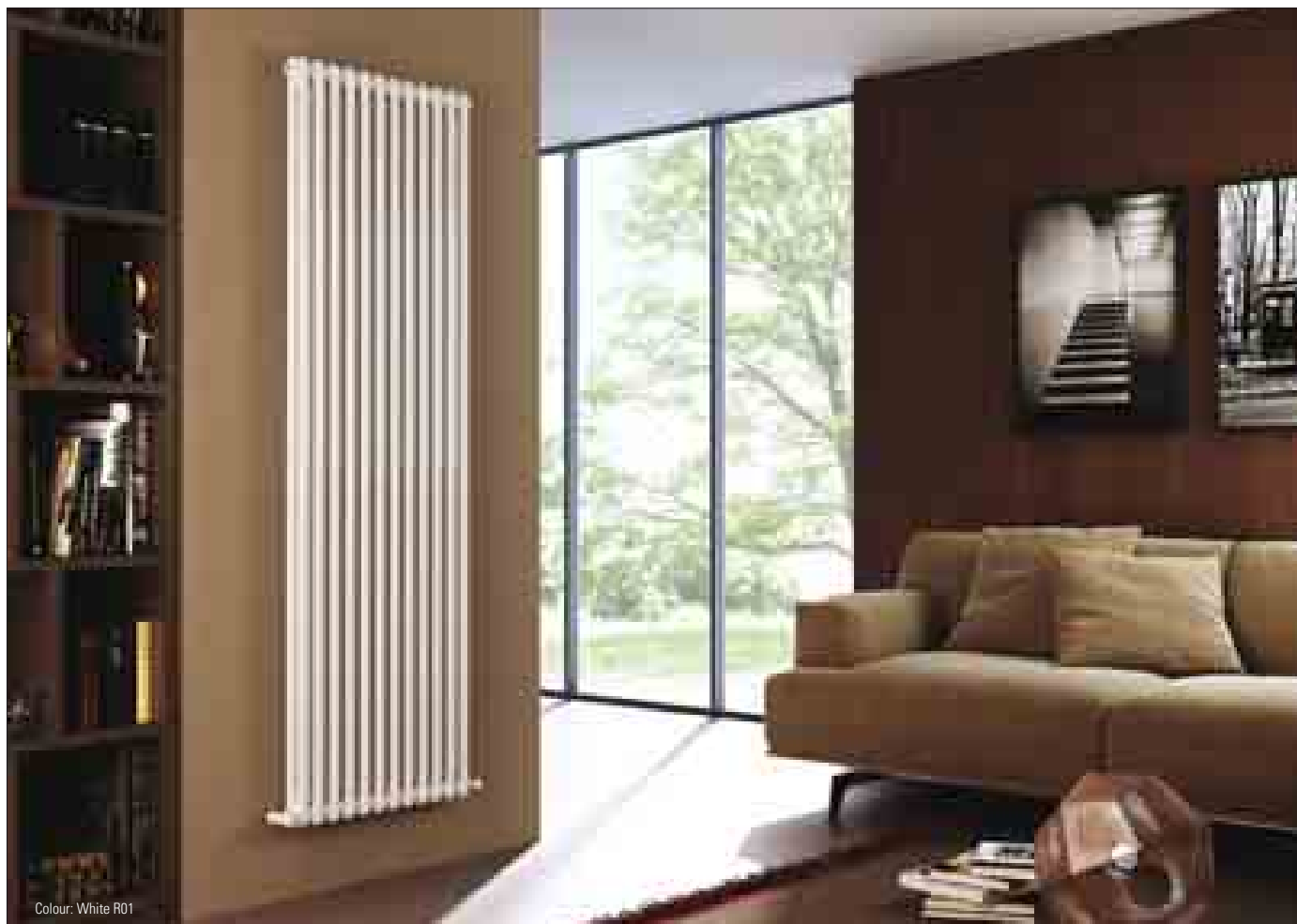
Colour: White R01