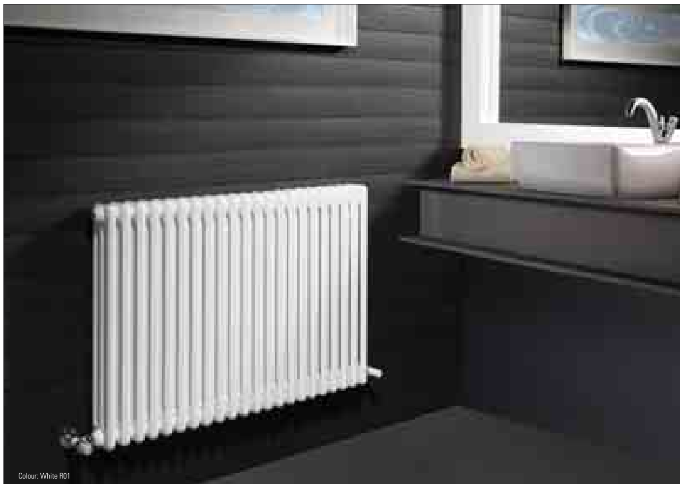
Colour: White R01